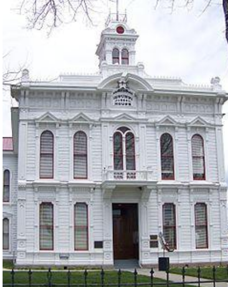
The Mono County Courthouse located in Bridgeport, CA.

My husband and I were on our yearly outing to the Eastern Sierras. Our first stop, Bridgeport, California, off 395. Bridgeport is the county seat of Mono County, elevation 6600 feet with a population of 550, not counting cows. Our purpose: hiking the beautiful mountains. After our third day, the weather pattern was consistent: beautiful weather in the morning, then thunder, lightning and a heavy downpour in the afternoon (all afternoon) .