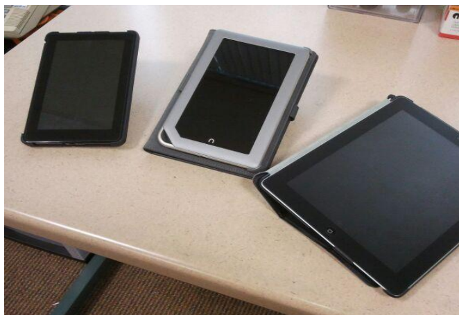
Three readers that can be used to access the Library's collection of ebooks: Kindle, Nook, and iPad.