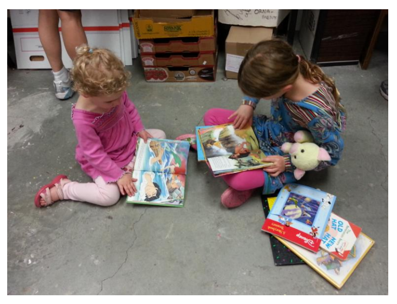
Friends of the Library Third Sunday Book Sale Come one! Come all! All ages love our books!