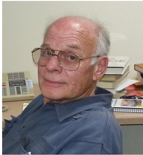
Information Services Librarian San Carlos Library

“When I worked as one of the reference librarians at the beginning of my career, I really did a lot of original research to find information that was