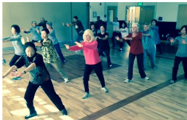
Tai Chi at the Library--- To enjoy this activity, check-out the Library calendar on our web site, www.scfol.org .

We cannot accept guns (including Nerf guns), porcelain gifts, breakable items, stuffed animals, or anything used.” This just in: We can waive your fines and fees if you donate a new toy as well!