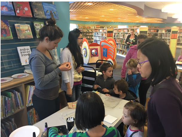
Tile painting project at the library.